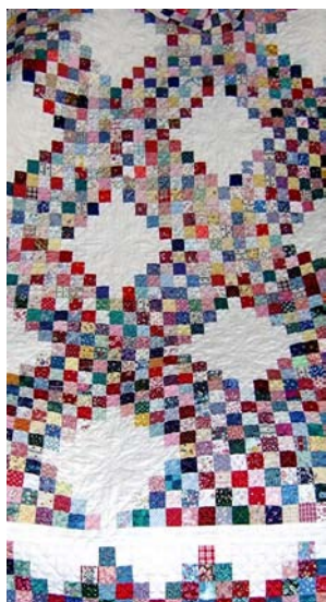
Triple Irish Chain

The goal is to have every AQQ member make at least one 9-patch unit. You may make more, of course. We need at total of 600 9-patches for the quilt and the border. Any extras that we receive will go into a silent auction project.