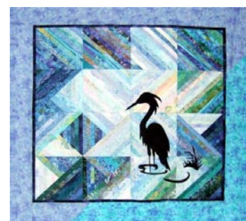
Chesapeake Silhouettes: 2009 Raffle Quilt Trilogy